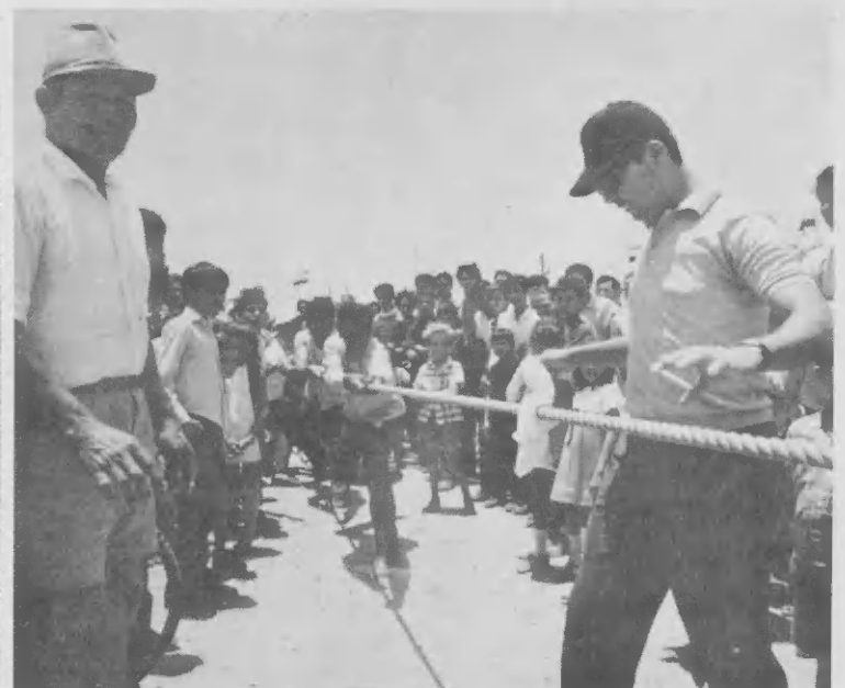
Tug of war - Rancamento di cabuya.